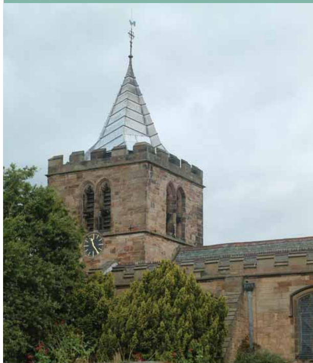
St Deiniol's Church Eglwys Sant Deiniol

Y castell newydd oedd cartref Gladstone ar ôl iddo briodi Catherine Glynne, etifeddes stad Penarlâg. Mae'r teulu'n dal i fyw yma.