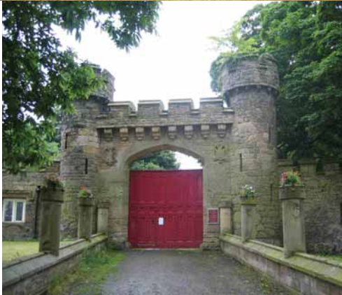
Leopold Gate, entrance to Hawarden Castle. Park open daily throughout the year.

Giât Leopold, y fynedfa i Gastell Penarlâg. Y tiroedd ar agor bob dydd drwy'r flwyddyn.