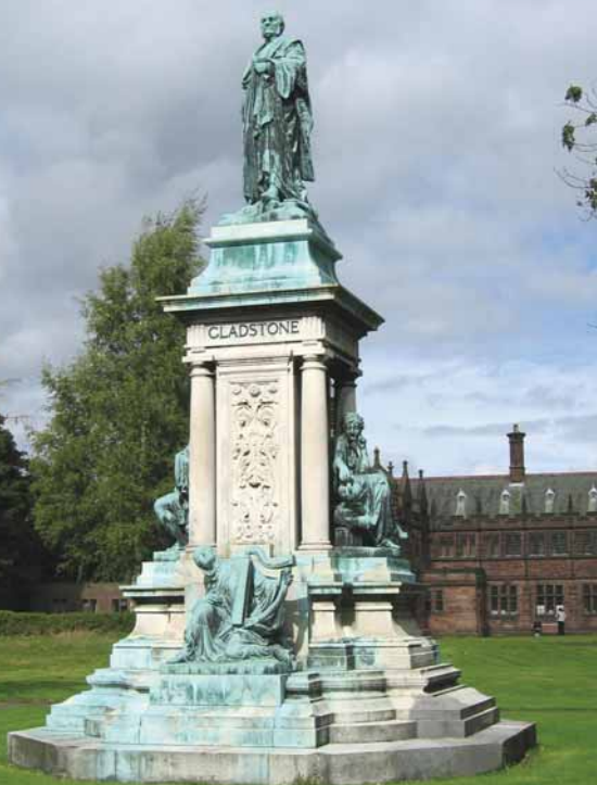
The Gladstone Monument Cofadail o Gladstone

5. At end of road turn L through staggered entrance by gate to continue along tarmac path. Pass bridge over A55 on RHS and continue ahead thro' staggered entrance by gate. Continue down road passing Spinning Wheel Inn. Take next L onto lane marked Cherry Orchard Farm.