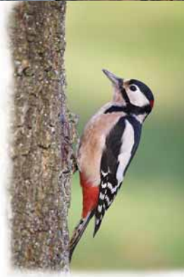
Great spotted woodpecker Cnocell fraith fwyaf

Ymlaen i'r postyn diwethaf ar y LICH yna mynd yn groesgornel i'r Dd. Croesi cae i giât arall, ymlaen i lôn werdd (anwybyddu'r llwybrau ar y Ch a'r Dde). Ymhen 800m ar ôl Trelogan ewch heibio'r arwydd postyn ar y LICH. Ymhen 500m ar ôl yr arwydd hwn, troi'n sydyn i'r Ch ar gyffordd y llwybr a disgyn yn serth gan gadw'r hen wal ar y LIDD. Dilyn y llwybr llydan i lawr i Fwthyn Pentreffynnon. Cerdded ymlaen a heibio'r bwthyn i'r giât werdd. Troi i'r Dd i'r ffordd a dilyn am 800m i dreif Fferm y Wern sydd ar y LICH.