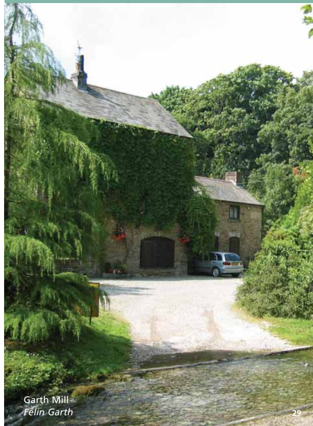
Garth Mill Felin Garth